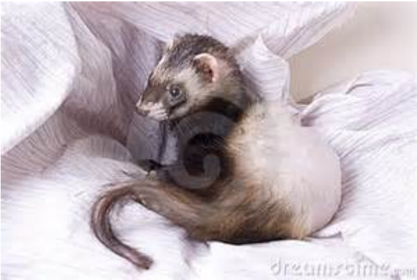
As disease progresses