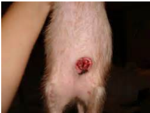
Ulcerating skin tumor