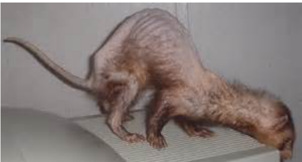
Adrenal but also very thin; potential neglect.