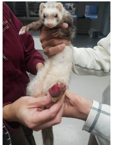
Large tumor enveloping foot