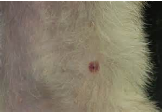
Mast cell tumors